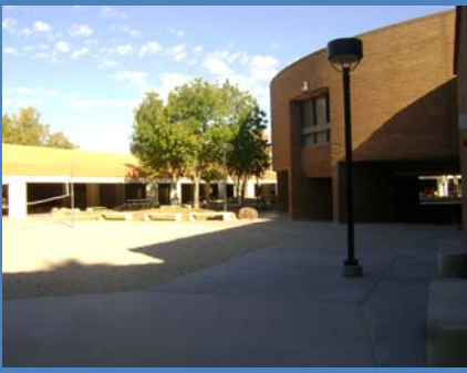
Corona del Sol High School