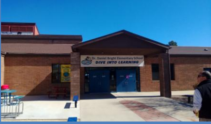
Cottonwood-Oak Creek Elementary