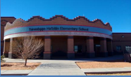
Tuba City Unified