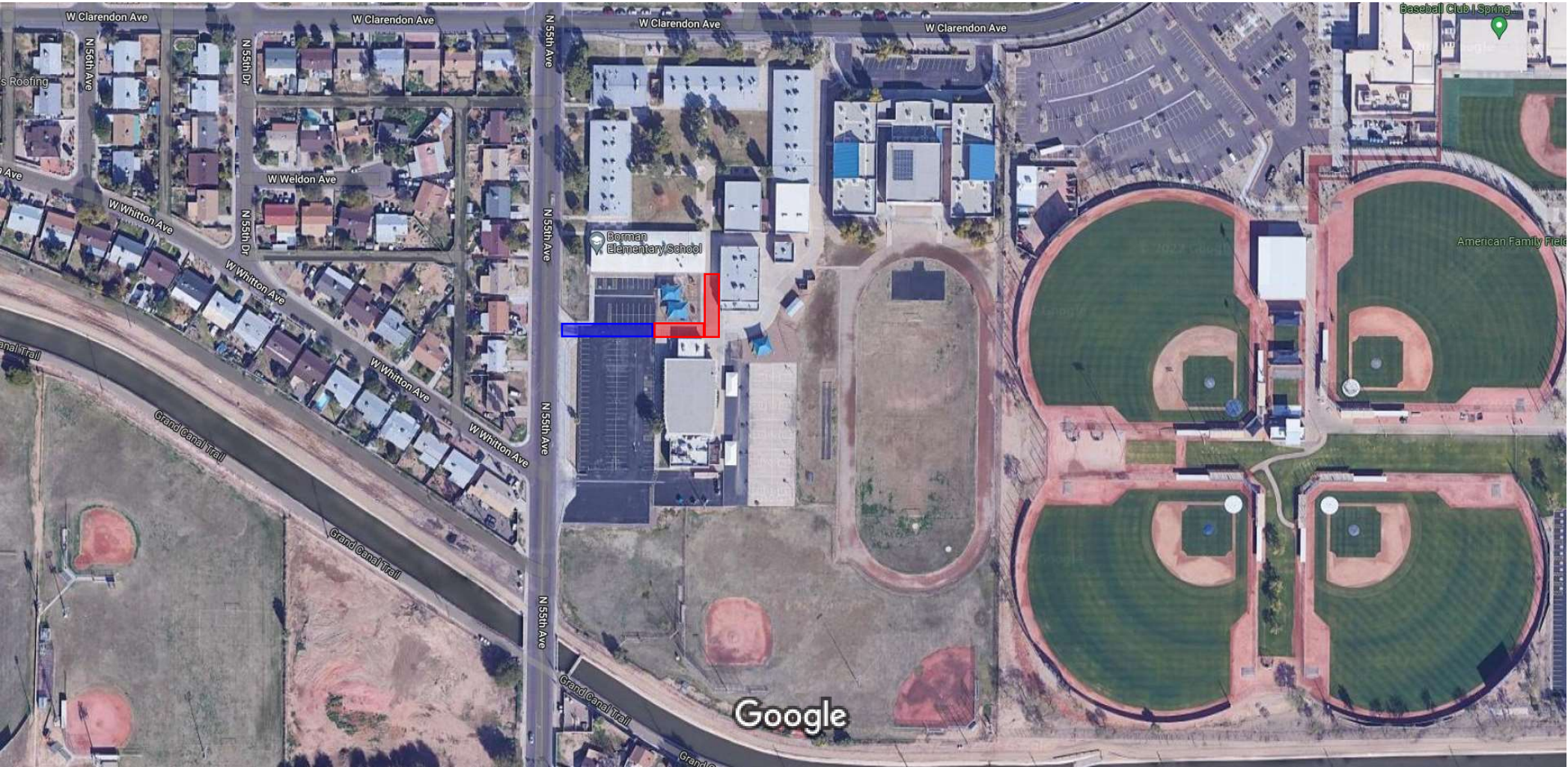
Imagery ©2022 CNES / Airbus, Maxar Technologies, U.S. Geological Survey, USDA/FPAC/GEO, Map data ©2022 100 ft