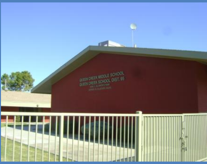
Queen Creek Unified